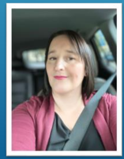
DIRECTORS AT LARGE